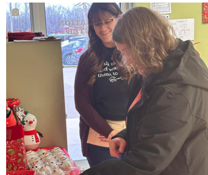
Holiday Open House SATURDAY DECEMBER 6, 2025