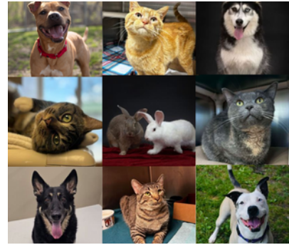
Pet Photo Calendar Contest SEPTEMBER - DECEMBER 2025