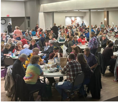
Spring & Winter Trivia Nights SATURDAY MARCH 22 & NOVEMBER 1, 2025