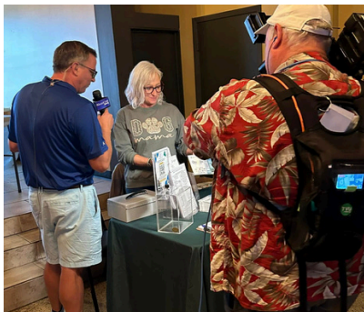
Yappy Hour FRIDAY OCTOBER 10, 2025