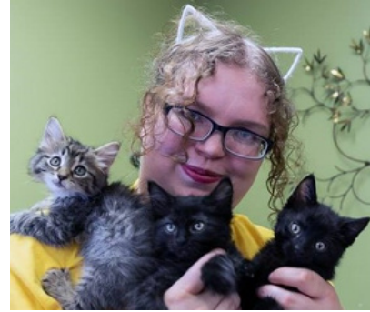
Kitten Shower SATURDAY MARCH 8, 2025