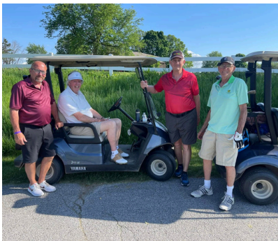
Par Fore Pets Golf Outing SATURDAY MAY 17, 2025